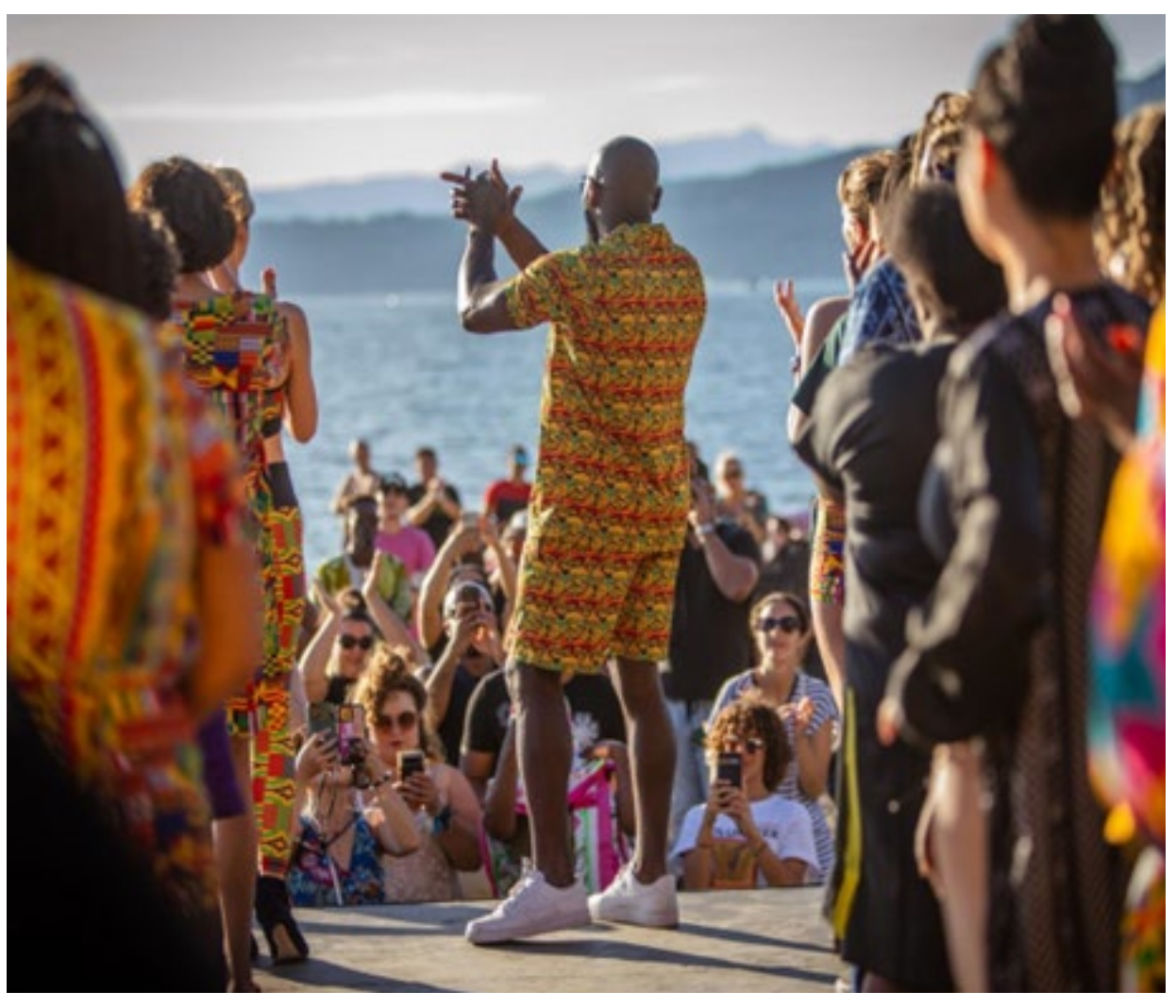
African Descent Festival Society, Vancouver.