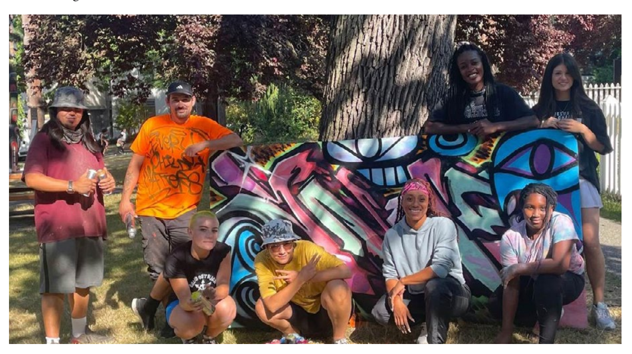
B.C. Black History Awareness Society, Victoria.