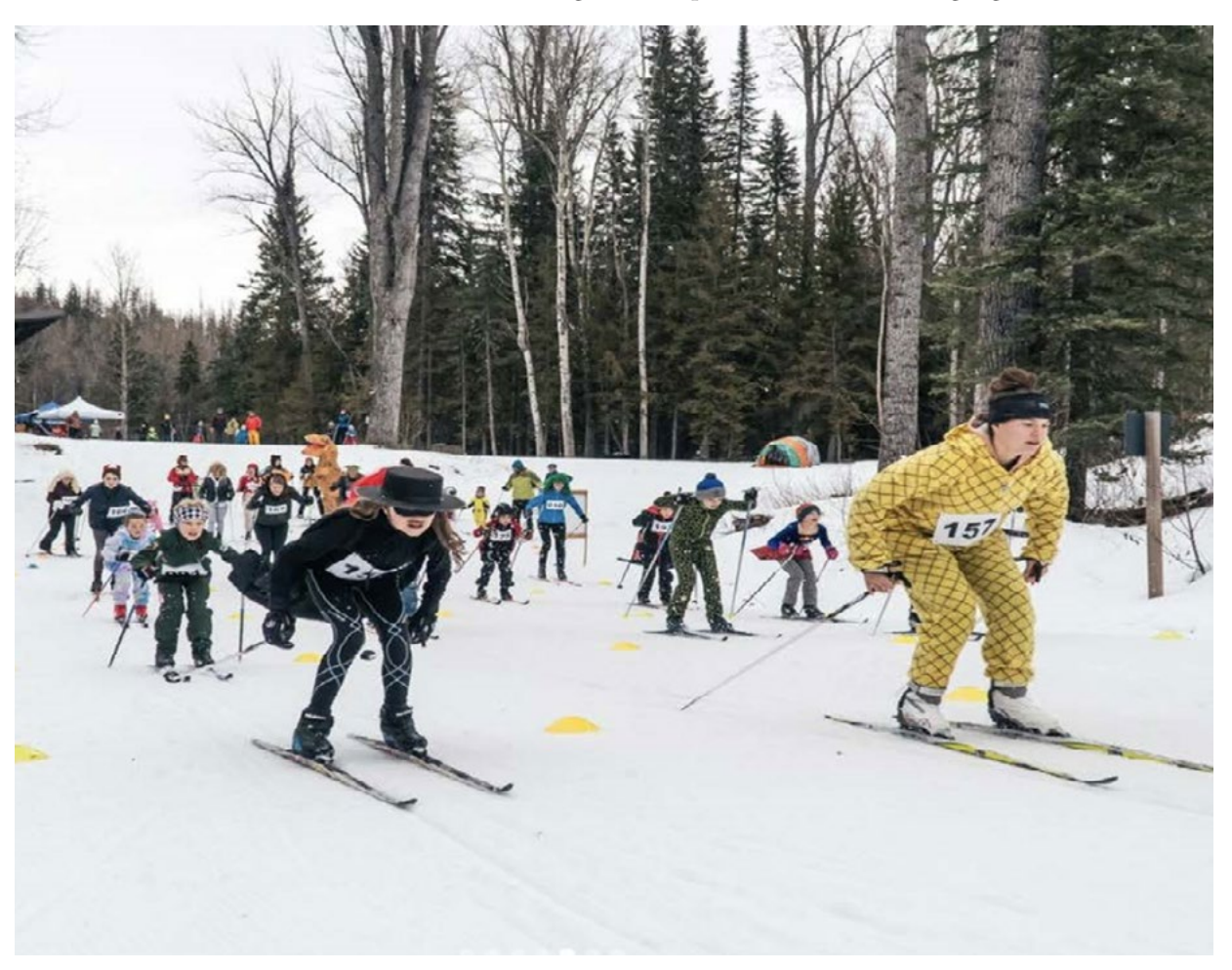
The Fernie Nordic Society

Prior to applying, applicants should read all relevant chapters and appendices of the Program Guidelines to ensure that they understand all eligibility requirements for receiving a grant.